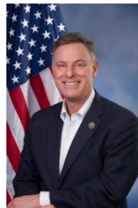
Congressman Scott Peters California's 50 th District